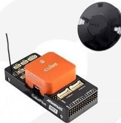
2 Cube Orange Here3 GPS