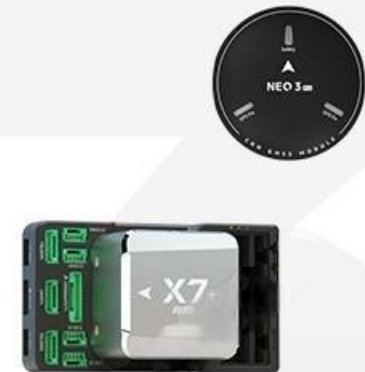
3 CUAV X7+ NEO3 Pro GNSS