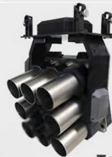
Tear Gas Launcher