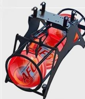
Fire Extinguish bomb