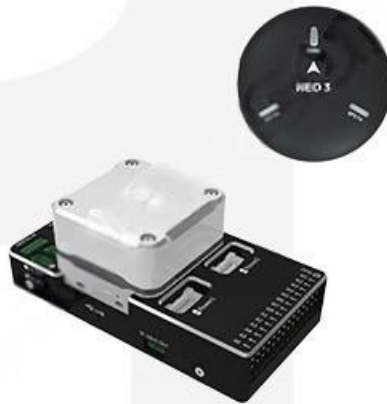
1 CUAV V5+ NEO3 GNSS

Thousands of times tuning and flights ensure safety and perfect performance.