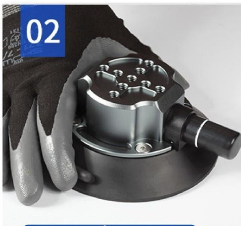
Air release | disassembly