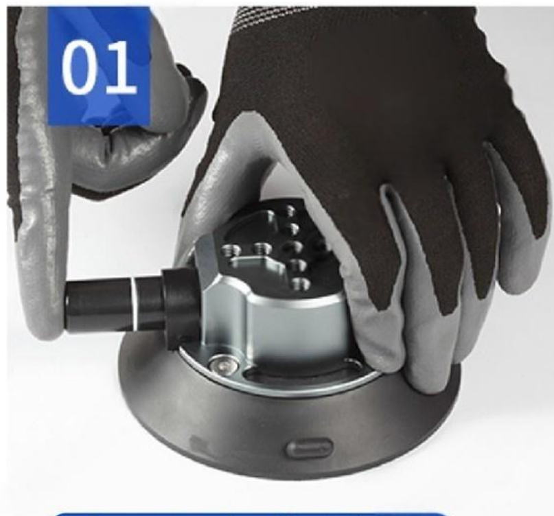
Gas extraction / installation